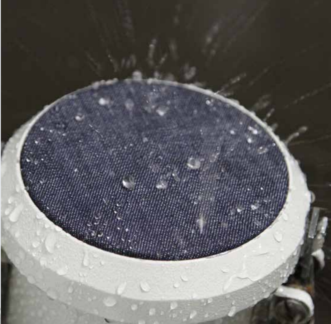
Bundesmann test for the evaluation of water repellency carried out at RUDOLF GROUP.